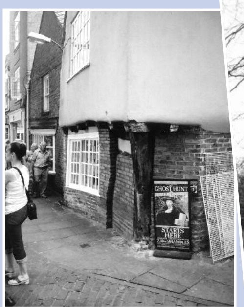
The ghosts of York are now the subject of a 'ghost walk'.